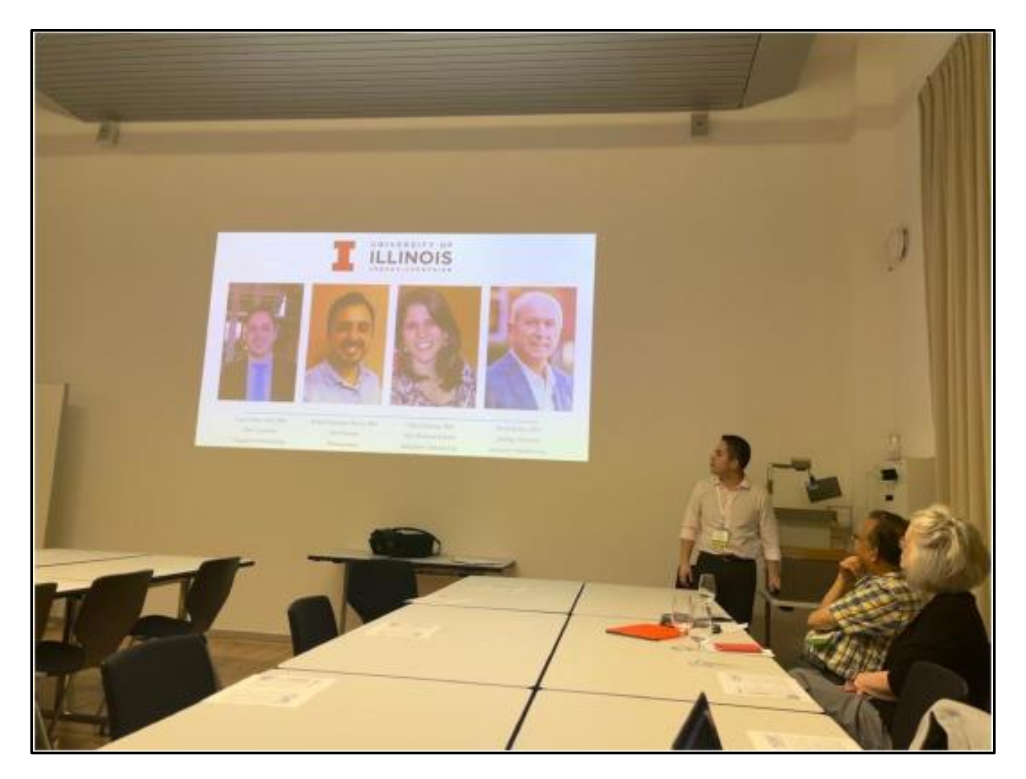
Fig. 2. PNIRS<sub>Ibero-America</sub> proposal presentation in Zurich, Switzerland in June 2022.